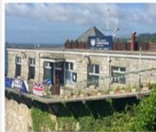
Single Box Ad