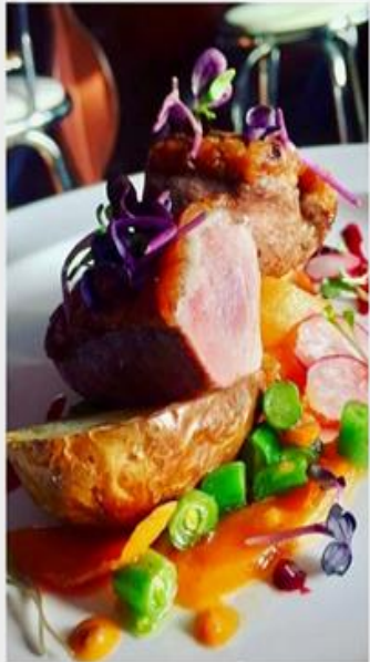
Sky Scaper Ad